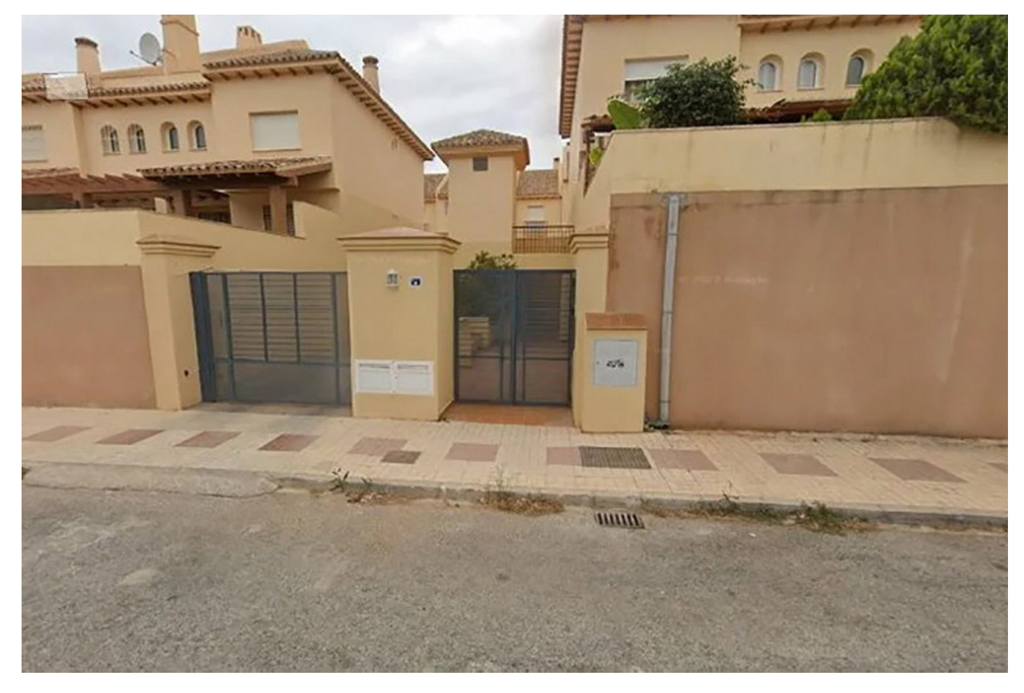
Спальни: 3 Статус: Продажа