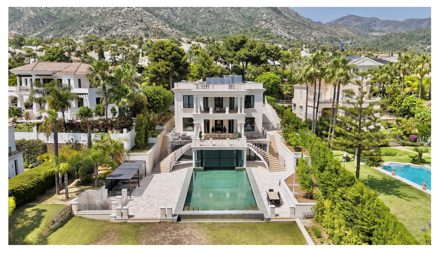
Спальни: 8 Статус: Продажа

Ванные: 10 М² Размер: 2 200 Тип недвижимости: Вилла Места: по запросу