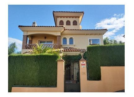
Цена: 850 000 € М² Участок: 554

Ванные: 3 М<sup>2</sup> Размер: 371 Тип недвижимости: Вилла Места: по запросу